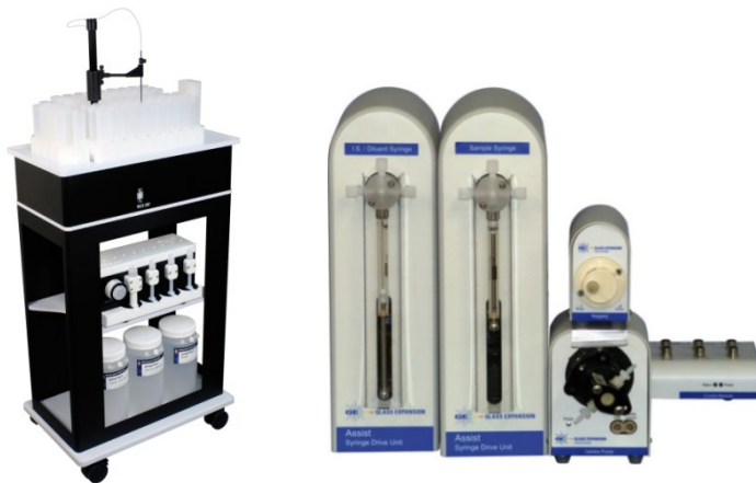
Elemental Scientific 'prepFAST' and Glass Expansion 'Assist CM' inline dilution systems

Inline dilution systems remove the need for manual dilutions by laboratory personnel for sample types such as seawater, brine solutions, effluents, soils and sediments, metals and mining samples that often exceed the TDS limit of ICP-MS. Real-time, in-line dilution also means sample analysis times are constant, independent of dilution factor.