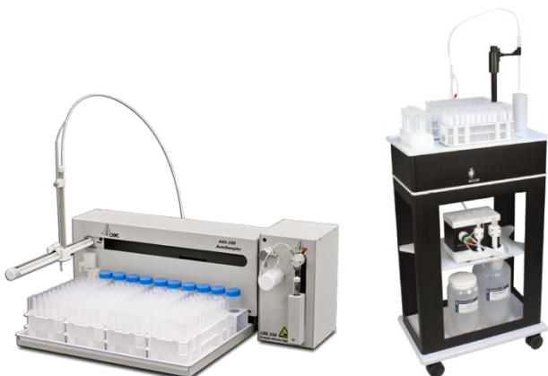
The Cetac Technologies 'SDS-550' and Elemental Scientific 'prepFAST', Offline Sample Dilution Systems

Offline dilution systems are programmable dilution systems that automate the preparation of calibration standards and samples prior to analysis by ICP-MS. Using a purpose-built software platform, method programs are developed for preparing sample batches, instructing the sampler and auto-dilution system on the volume of sample to be collected, the location of the awaiting dilution tube, which reagents to mix and the final dilution volume required for each sample. The preparation of calibration standards from bulk standards and the addition of internal standard to each solution are also possible. Preparation work is typically done offline with a dedicated PC and without being directly connected to the ICP-MS. Labor intensive sample preparation is greatly reduced for routine applications without sacrificing accuracy and precision, requiring only the transfer of prepared solution racks to the ICP-MS autosampler for analysis.