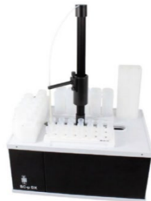
Low volume autosamplers from Cetac Technologies and Elemental Scientific