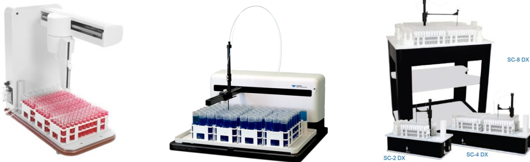
General purpose range of autosamplers from Analytik Jena, Cetac Technologies and Elemental Scientific

Autosampler enclosures are available for all models and are recommended for minimizing sample contamination. Purged systems are preferred as they create a positive pressure within the autosampler compartment, thereby eliminating dust particles from the local environment.