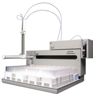
The Cetac Technologies ADX-500 Online Autodilution Accessory with ASX-520 autosampler

Online dilution systems are designed for automatic dilution when measured elements exceed the calibration concentration range during the analysis of a sample. When overrange concentrations are detected, the sample is automatically diluted and re-sampled until all overrange elements fall within the valid calibration range. The results are then automatically updated by the instrument controlling software to account for the dilution factor and the next sample is analyzed. This frees valuable personnel from time-consuming, manual sample handling and eliminates the need for additional work upon completion of the analysis.