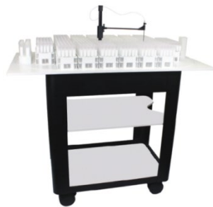
High capacity autosamplers from Cetac Technologies and Elemental Scientific