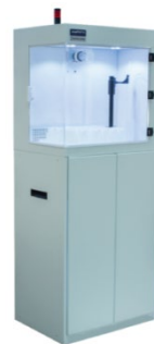
Ultra-clean autosamplers from Cetac Technologies and Elemental Scientific