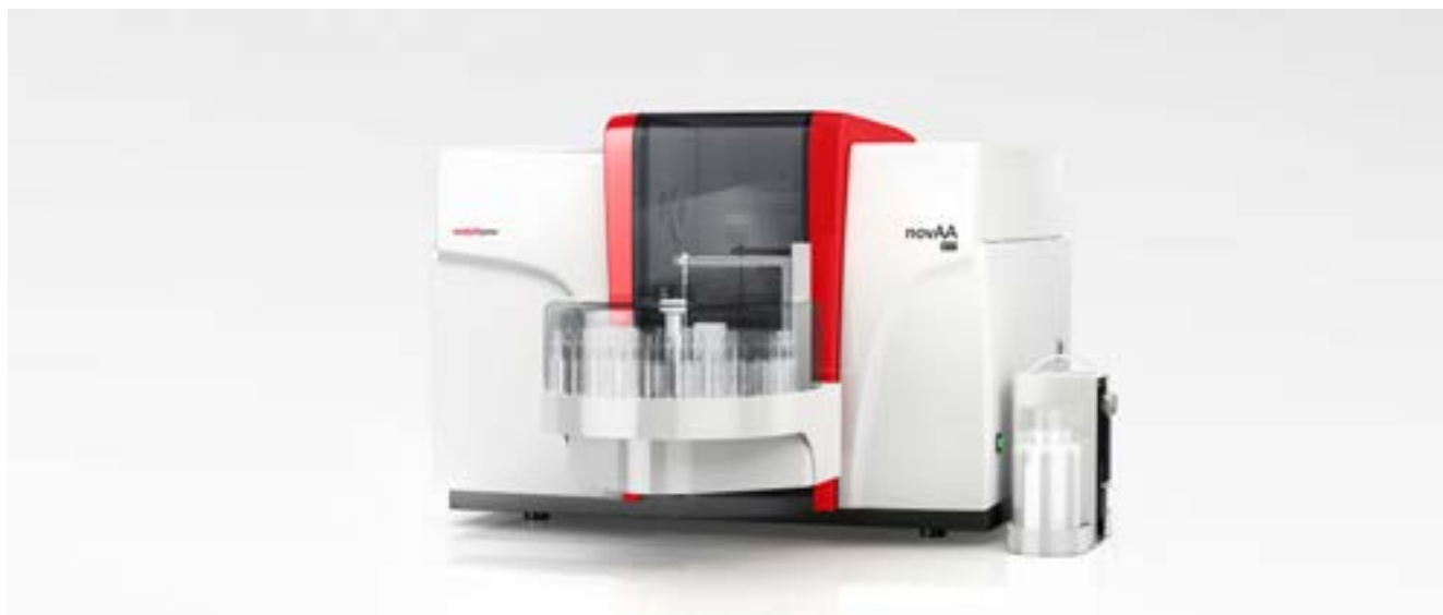
novAA 800 F with autosampler AS FD for flame technique