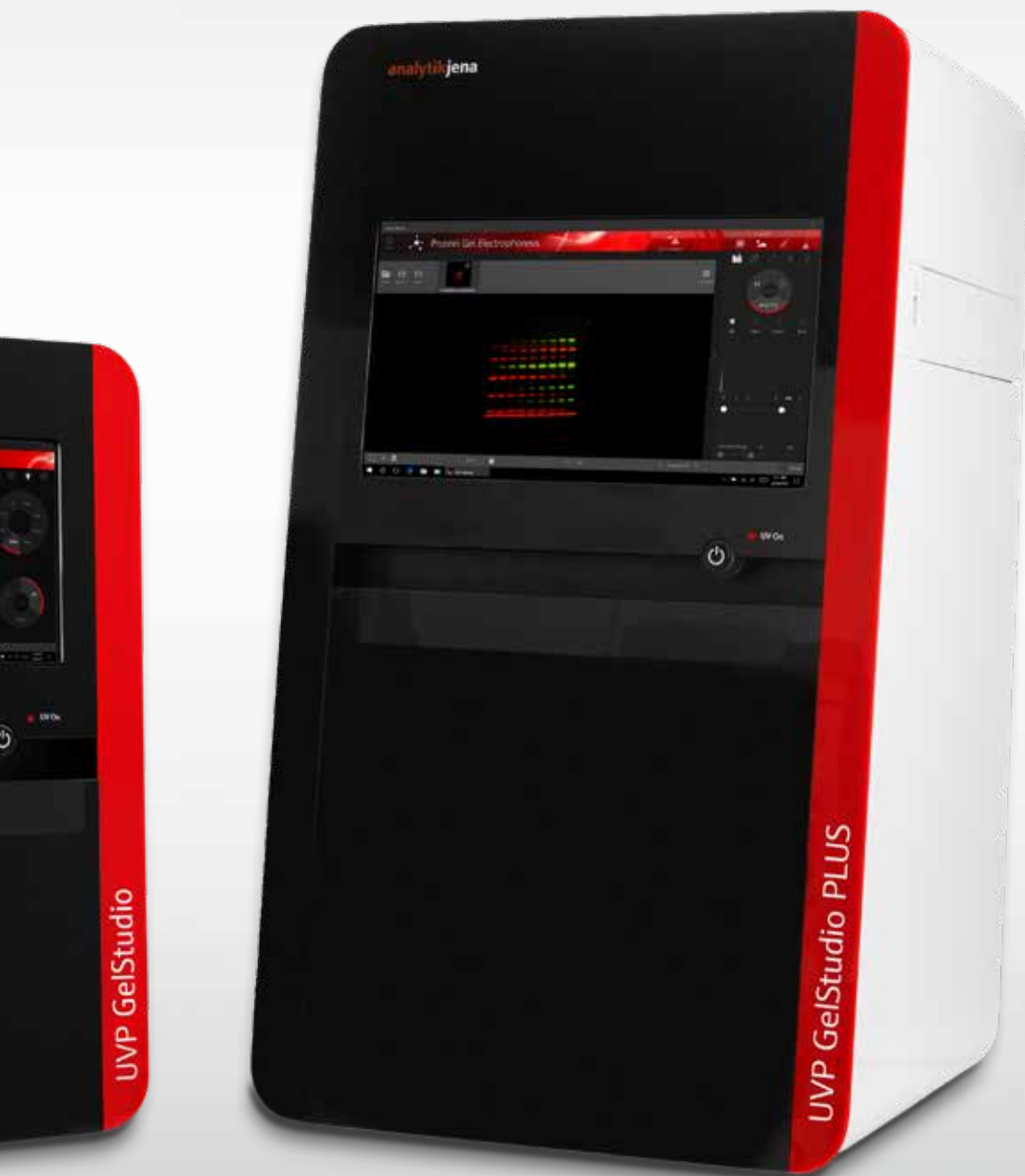
UVP GelStudio PLUS