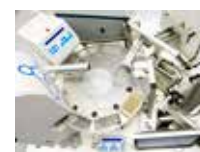
Fig. 3: CyBio robotic workstation (CyBio RWS)

The CyBi®-SELMA is a semi-automatic pipettor for precise and reliable liquid handling in microplates (Fig. 2). It operates via a touch screen where all liquid handling parameters and heights can be adjusted and methods can be stored. The pipetting technology of the CyBi®-SELMA 96/25µl head is exactly the same as in the CyBi®-Well vario 96/25 µl head, which is integrated in the CyBio robotic workstation (1) (Fig. 3). Serial dilutions can be performed with the CyBi®-SELMA 96/25µl using the corresponding