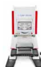
Fig. 2: CyBi®-SELMA 96/25 µl (CyBi®-SELMA) with 96-tip tray in the parallel transfer mode

8-channel magazine. The microplate adapter 384 supports the reliable liquid transfer in 384 well plates.