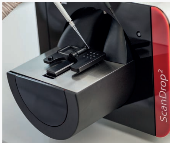
Fig. 2: Filling the Butterfly Cuvette